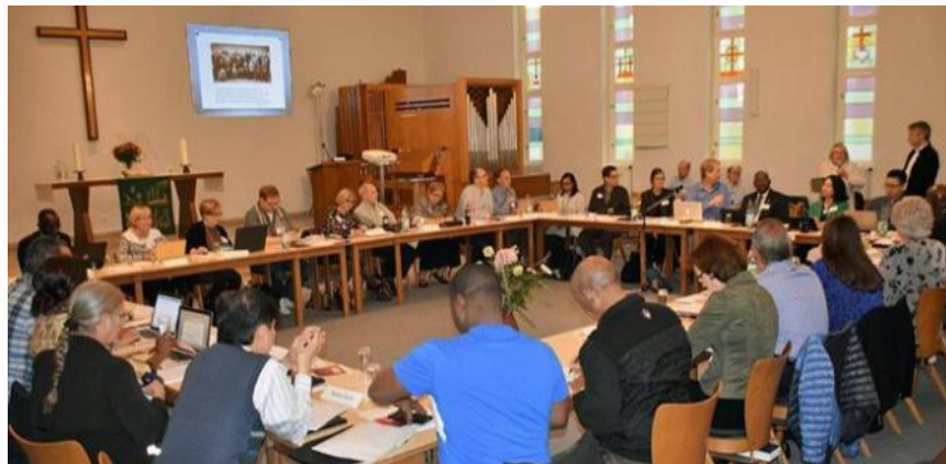
The Commission on a Way Forward met in Berlin Sept. 18-20.

The 32-member commission has been meeting throughout the year to seek a way through the denomination's impasse over how LGBTQ individuals are included in the church. The bishop-appointed commission serves in an advisory capacity to the bishops, and in November, the bishops reviewed the three possibilities the commission is currently considering. The bishops also have called a special General Conference in February 2019 to take up the bishops' legislation based on the commission's work.