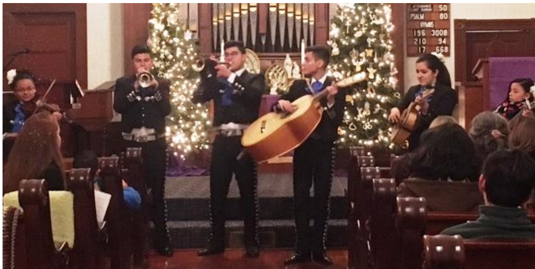
Above and Left— La Posada featured a youth mariachi band accompanying our “candlelit” procession through downtown.