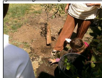
Planting a tree on Pentecost